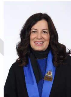
Carmel Noon Central Ward Councillor